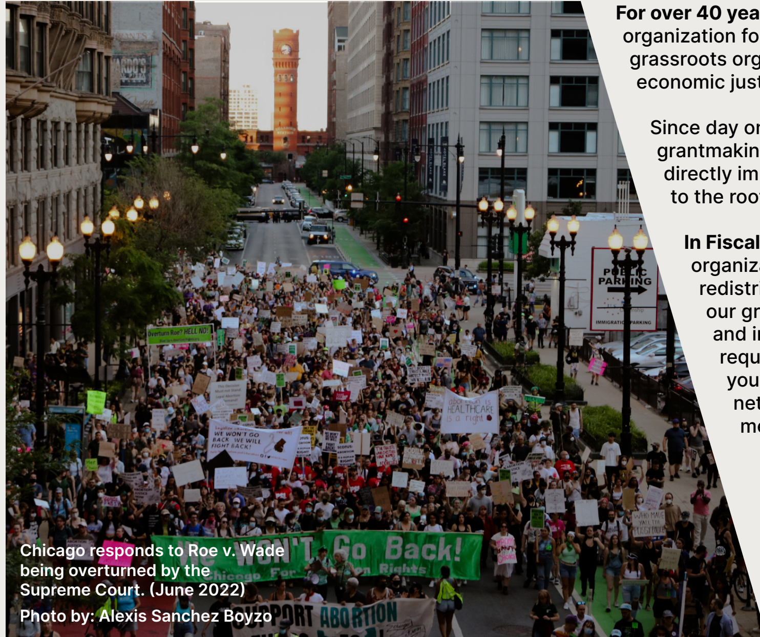
Chicago responds to Roe v. Wade being overturned by the Supreme Court. (June 2022)